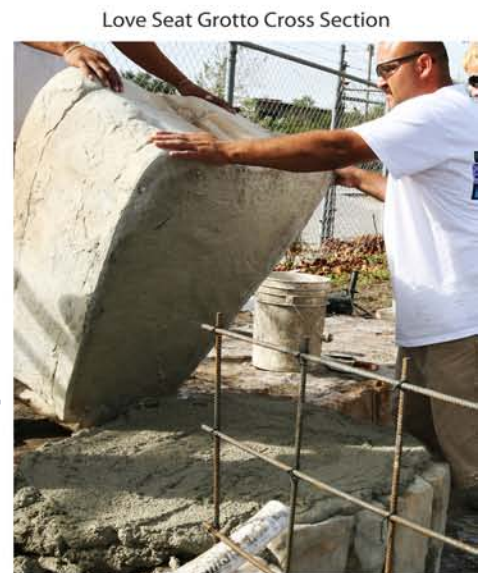
Love Seat Grotto Cross Section

Mortar side boulders #1,2,3 to pool beam and/or concrete pad.