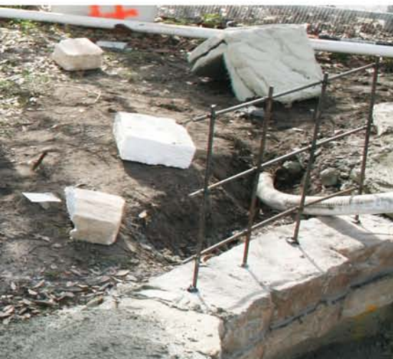
Love Seat Grotto Cross Section

Structurally the Loveseat Grotto is like a balcony on a high rise hotel. The pool beam or footing anchors the wall and cantilever; the side boulders hold the lid in place for concrete but have no structural value so they can be set at any angle or recessed for a pool cover, for example.